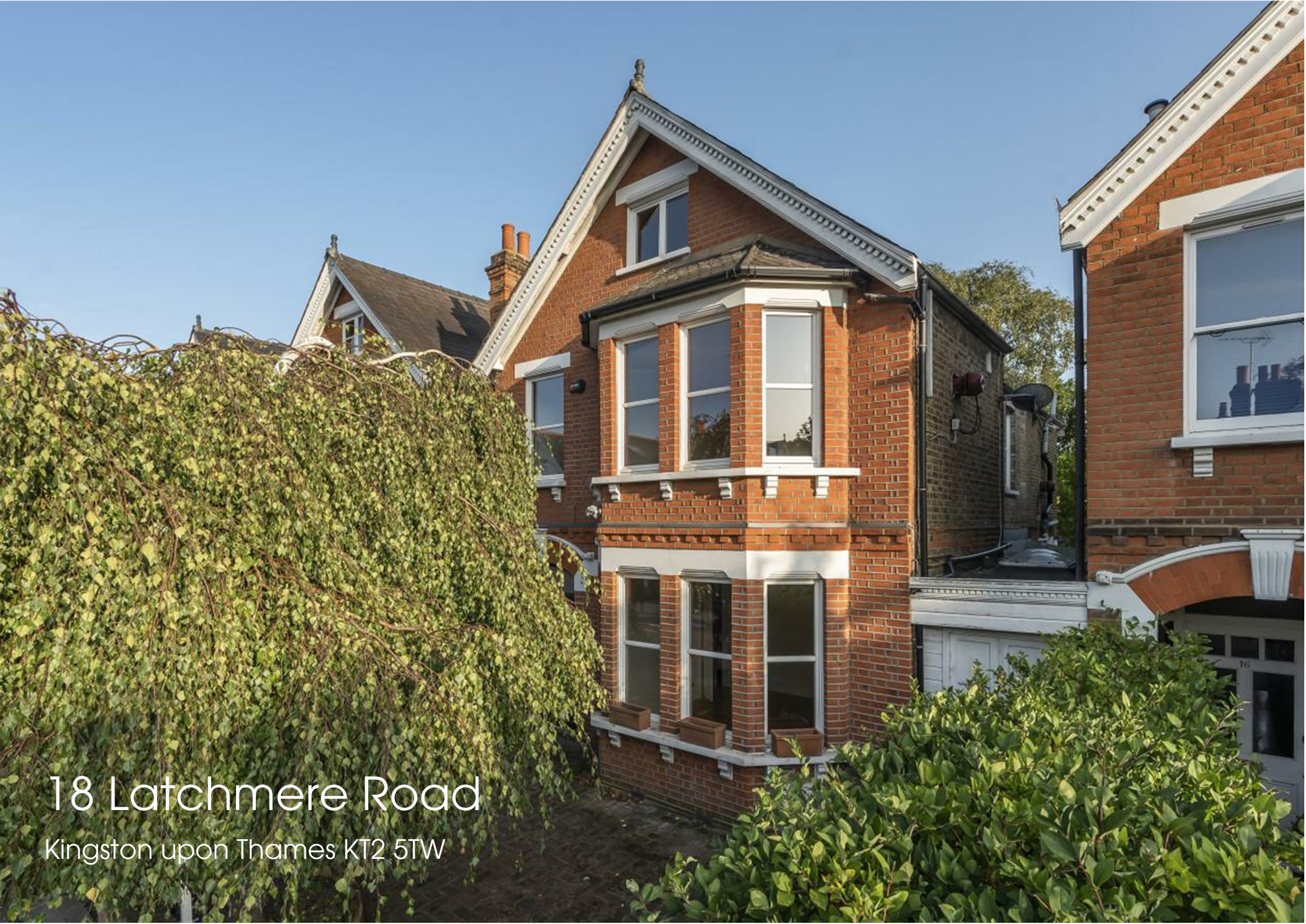
18 Latchmere Road Kingston upon Thames KT2 5TW

34 Richmond Road Kingston upon Thames Surrey KT2 5ED www.gibsonlane.co.uk Tel: 020 8546 5444